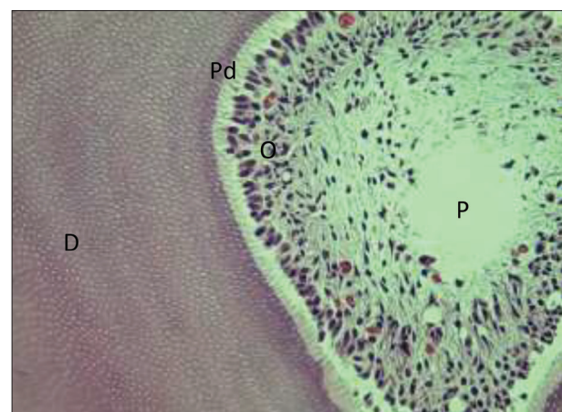
Figure 3. Tooth cross section – control group; pulp, odontoblast layer, predentin, and dentin without morphological changes can be seen (H&E, 400 \times ); P – pulp; O – odontoblast layer; Pd – predentin D – dentin

the cases, weak or moderate (grade 1) in 9.1% of the cases while absence of staining (grade 0) was not registered in either case (Table 2).