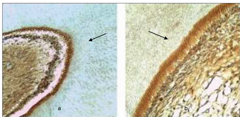
Figure 2. Cross section of the teeth of rats which received lead in the course of 30 days: a) representation of high expression (grade 3) of fibronectin in cytoplasm of odontoblast (200 \times ); b) representation of high expression (grade 3) of fibronectin in cytoplasm of odontoblast 400 \times )